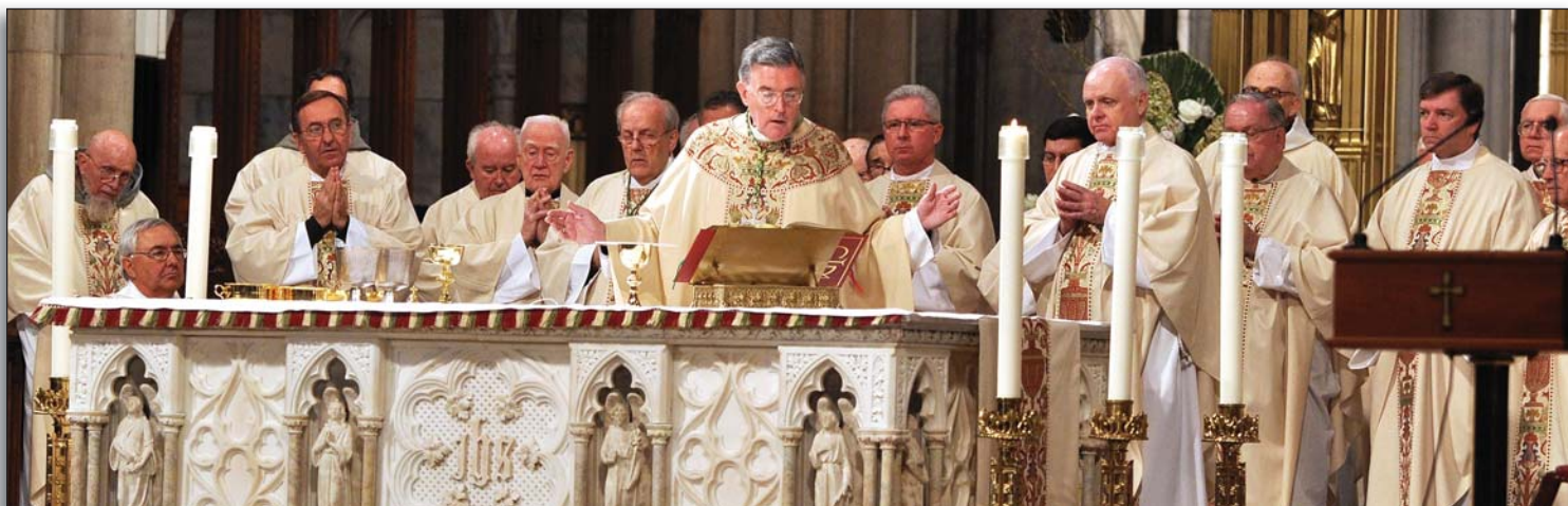
More than 40 Priests concelebrated The Mass of Remembrance on October 6 at Saint Patrick's Cathedral