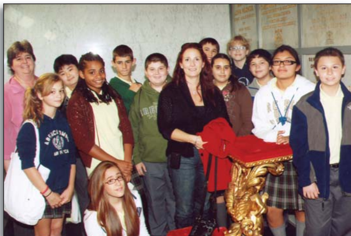
Students visit Cardinal Cooke's Crypt following the Mass on October 6

More than 200 students from four elementary schools in The Archdiocese of New York were among those who attended the 26th Anniversary Mass of Remembrance on October 6 at Saint Patrick's Cathedral.